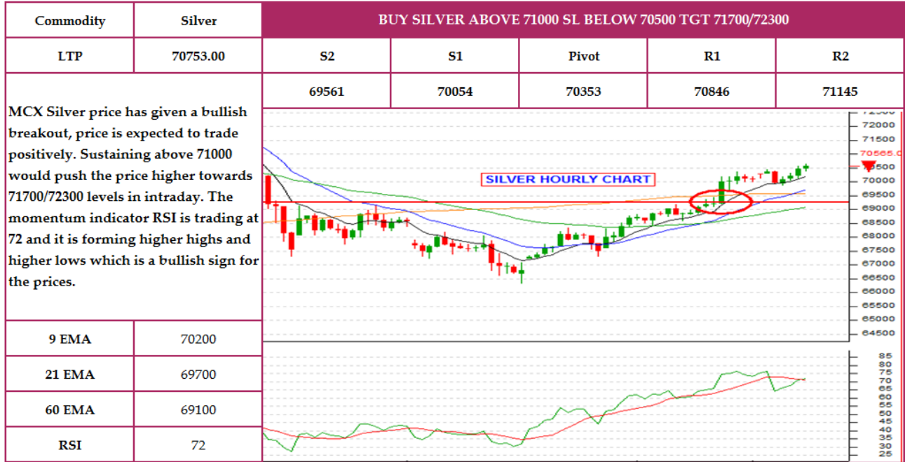
Chart of the days